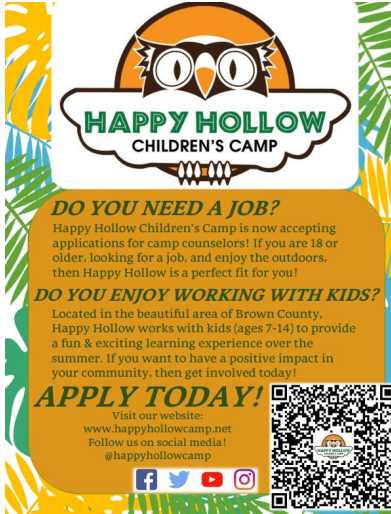
← 1st Flyer Prototype