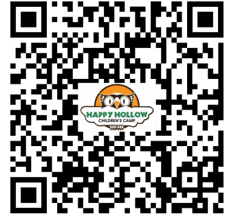
(link doesn't work... yet)